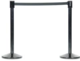
Stanchion with 7" Strap