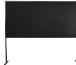
Horizontal Display Board