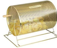
Small Brass Draw Barrel